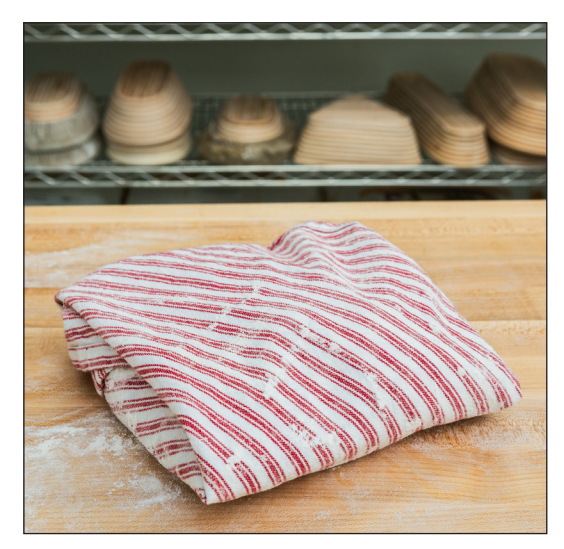
Close the towel by folding it gently over the dough. Make sure to leave room for it to expand.