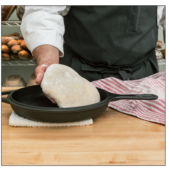
Transfer the dough carefully from the towel to the hot pot. Turn the dough over as you transfer it so that it lands seam side up—this way, you don't have to score it.

For more on baking in Dutch ovens, see page 376.