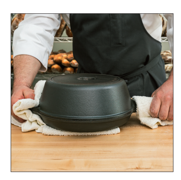
Immediately place the lid on the pot, put it back in the oven, and close the oven door.

This no-knead method and recipe prove that it's hydration and time, rather than using a mixer, that develop gluten in a dough. Mixers only speed up the process.