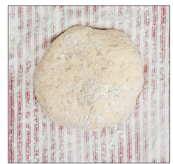
Plour a kitchen towel well, and transfer the gently rounded dough onto it with the seam side down. Dust the dough with flour, just enough to leave a fine layer on the surface.